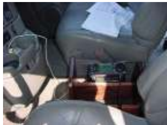
K9JP, Jeff's mobile shack.

Email pictures of your shack with a description to kj7bs@cox.net .